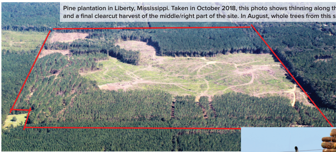
Pine plantation in Liberty, Mississippi. Taken in October 2018, this photo shows thinning along the bottom/left part of the harvest site and a final clearcut harvest of the middle/right part of the site. In August, whole trees from this site were tracked back to Drax Amite.

An independent, on-the-ground investigation of Drax's pellet mill in Amite, Mississippi ("Drax Amite"), not associated with SIG's analysis, helps explain what it means for Drax to source from thinning of non-industrial pine plantations. As documented during that investigation, Drax's "thinnings" include large, whole trees up to 35 and 45 feet tall and 14 inches in diameter.