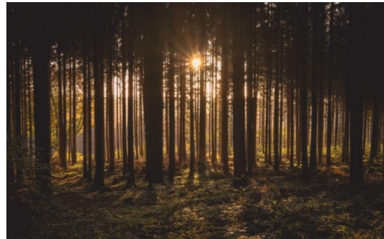
The Forest Certification Experience - A Commentary by Dovetail Partners