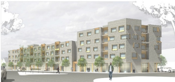
Affordable Housing Opportunities with Mass Timber

SENT TO LSU AGCENTER/LOUISIANA FOREST PRODUCTS DEVELOPMENT CENTER - FOREST SECTOR / FORESTY PRODUCTS INTEREST GROUP