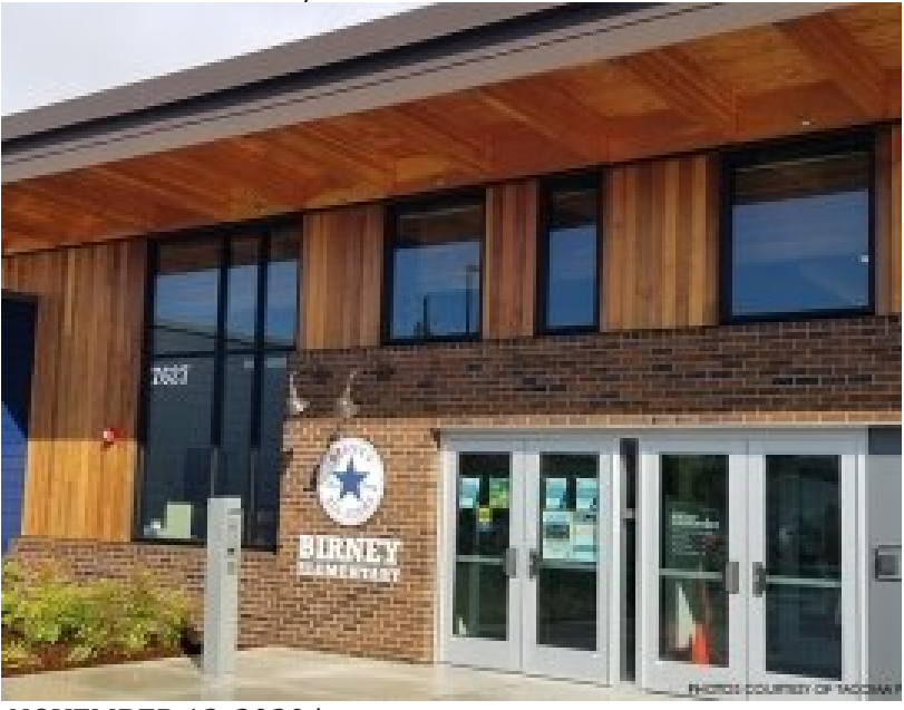
NOVEMBER 12, 2020 |