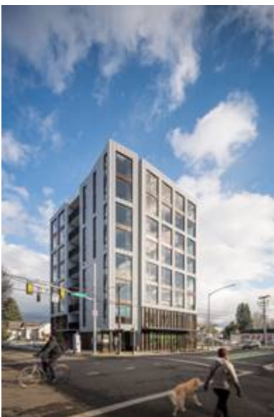
Carbon 12 in Portland, Oregon is the tallest building in the United States made with mass timber.

But there are big questions being asked about just how sustainable the new building material is – especially about how forests that produce mass timber are managed, and how much CO 2 would be emitted in the logging, manufacture, and transport of the wood products used in the construction. So far, critics say, there aren’t good answers to these questions.