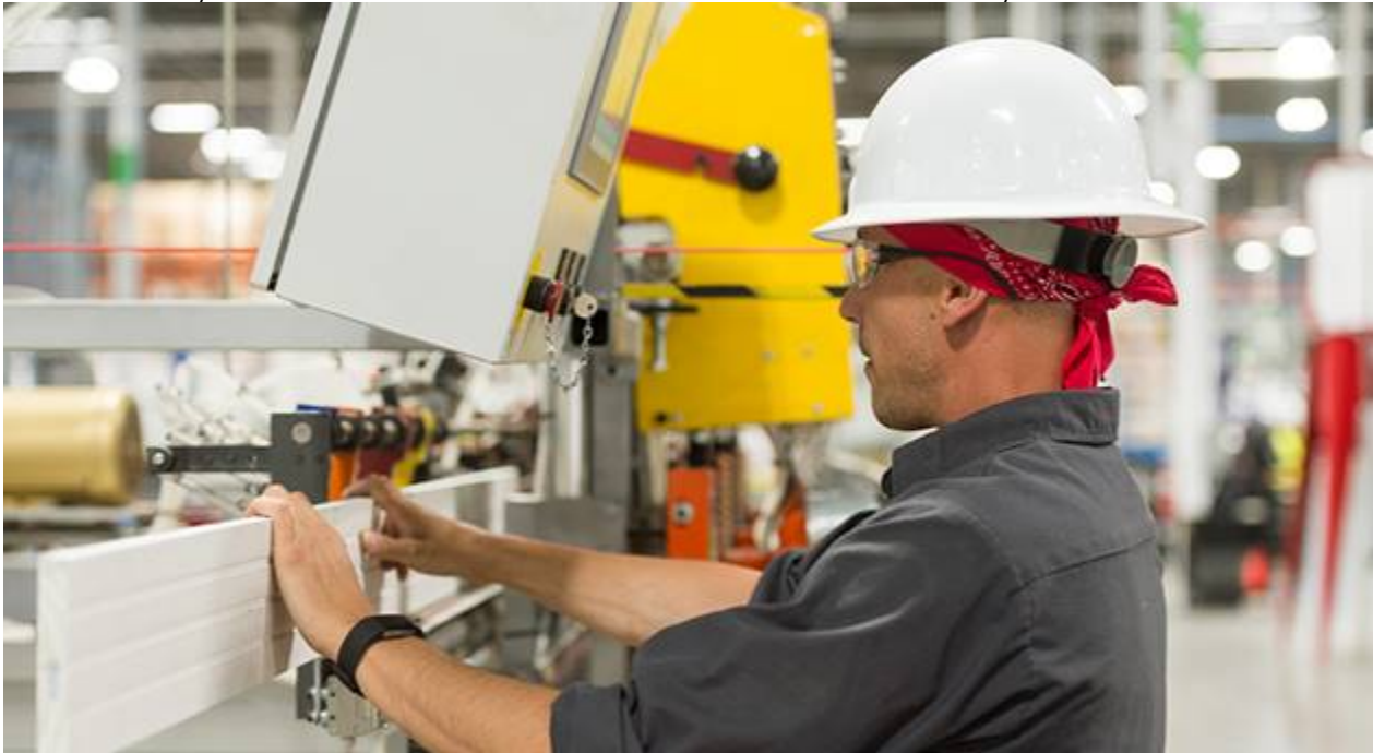
Katerra's Phoenix operation.

SENT TO LSU AGCENTER/LOUISIANA FOREST PRODUCTS DEVELOPMENT CENTER - FOREST SECTOR / FORESTY PRODUCTS INTEREST GROUP