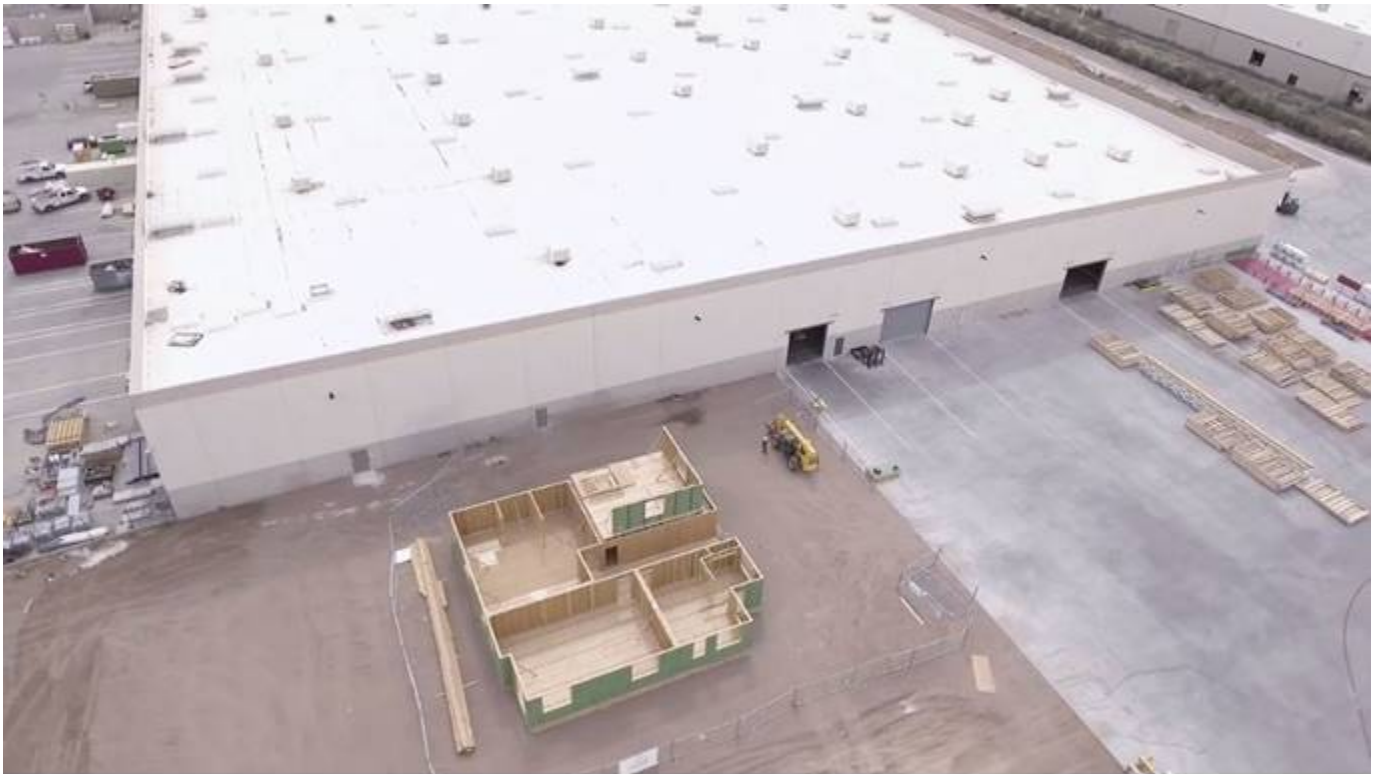
Katerra's existing plant in Phoenix totals 220,000 square feet.

By Bill Esler September 26, 2017 | 9:00 am EDT