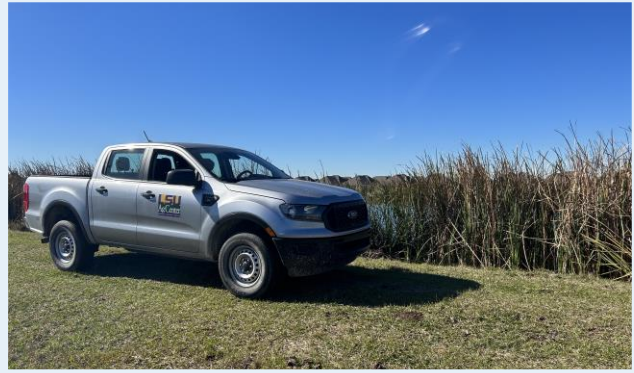
Site pictures from Gonzales waste stabilization ponds for floating solar deployment