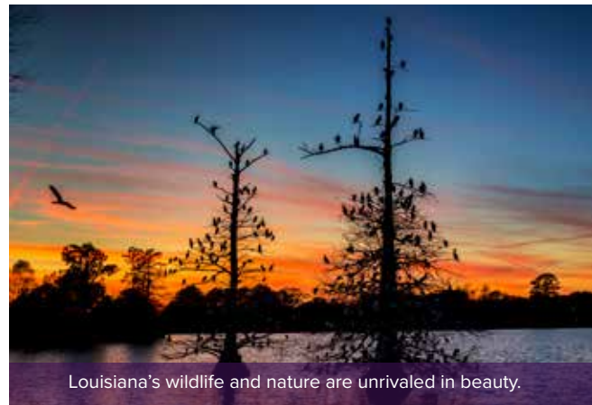
Louisiana’s wildlife and nature are unrivaled in beauty.

The capital city of Baton Rouge is a thriving place to live, work, and play, offering excellent work/life balance.