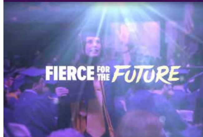
VIDEO: A Spirit Without Equal

In the past decade, LSU has graduated nearly 100,000 students from all of its campuses statewide. These graduates are the talented people who lead Louisiana's workforce. Learn more at: youtu.be/sY9SW0dBf5Y .