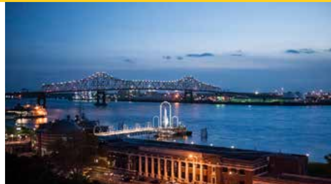
Downtown Baton Rouge has numerous leisure, culinary, and cultural activities in which to participate.

TOP 10 U.S. CITIES WITH THE MOST GREEN SPACES National Geographic, 2018